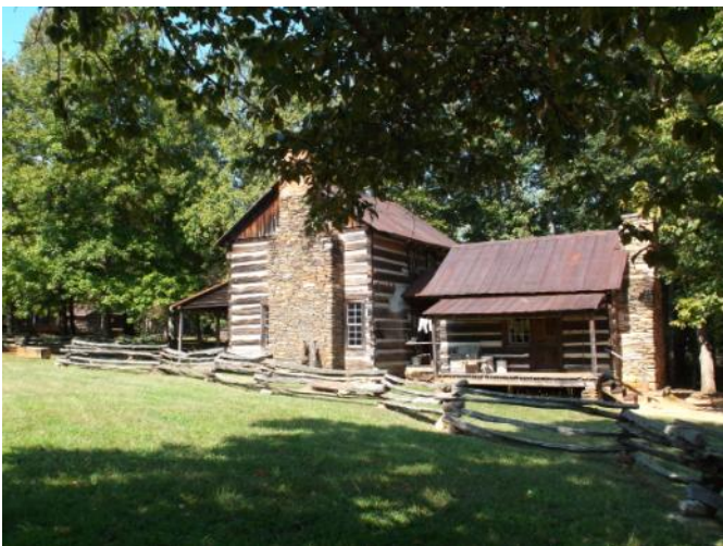
The Deitz House ca. 1820 Hart Square Village 2017